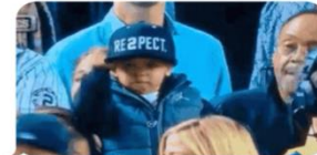
GIF Keyboard via #images

8 Glad to hear it. Let me know if you need anything. By the way, in case nobody has said it, Your refusal to make the arrest was a reminder what integrity looks like